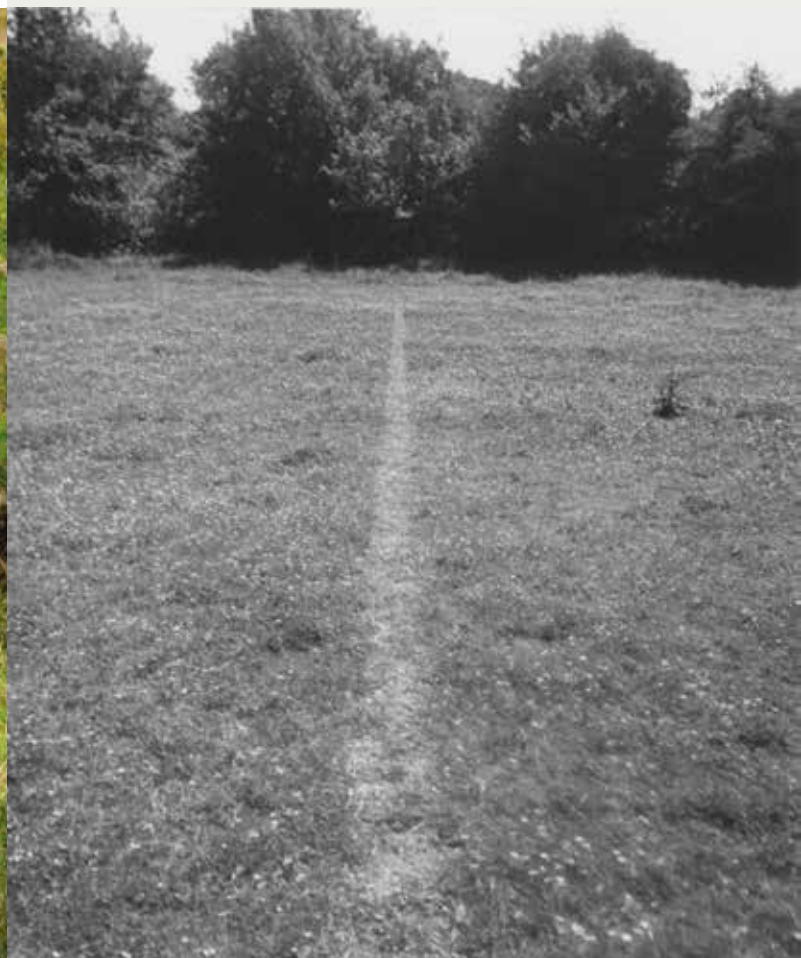
Image: A Line Made by Walking by Richard Long 1967. ARTIST ROOMS National Galleries of Scotland and Tate. © Richard Long. All Rights Reserved, DACS 2018.

The ARTIST ROOMS touring programme is delivered by the National Galleries of Scotland and Tate in a partnership with Ferens Art Gallery until 2019, supported using public funding by the National Lottery through Arts Council England, by Art Fund and by the National Lottery through Creative Scotland.