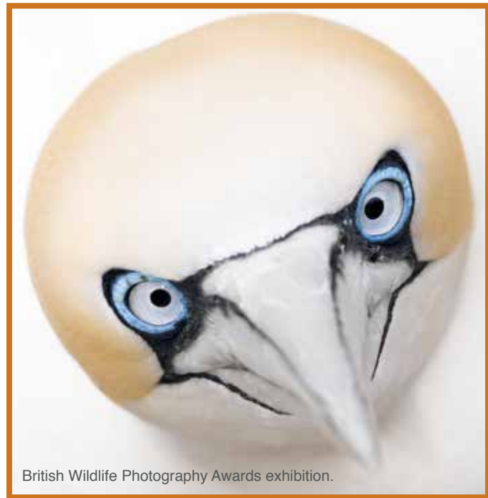
British Wildlife Photography Awards exhibition.

Explore the artworks in the Refuge exhibition.